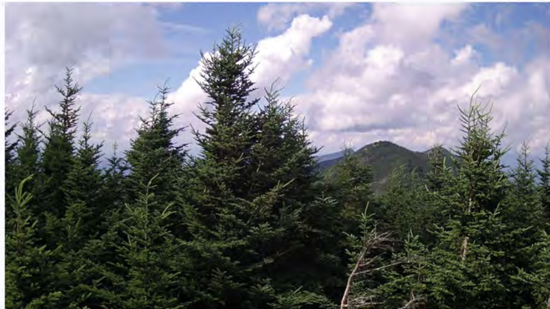
View of Mount Craig as seen from Mount Mitchell

This weather station is provided by NC High Peaks Trail Association operating as Friends of Mount Mitchell State Park. info@nchighpeaks.org