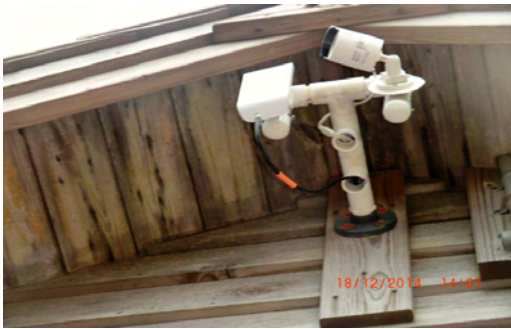
Our first webcam and Wi-Fi link installed in December 2014. Still working!

View our Mt. Mitchell Weather page at: https://nchighpeaks.org/davis/index.html