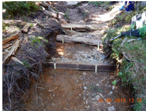
Steps installed by the NC High Peaks trail crew on the Mount Mitchell Trail.

High Peaks provides volunteer labor for routine trail maintenance. We have also provided volunteer labor as our 25% match for work funded under the N.C. Recreational Trails Program (RTP). This competitive state grant program funds trail improvements on public lands. We recently used over $50,000 in RTP funds to hire a contractor to upgrade a section of the Mount Mitchell Trail in the Park. High Peaks volunteers also worked on this trail.