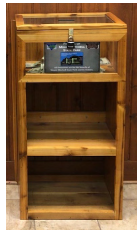
Donation Box at the Park Office, one of three.

There are no fees to simply visit the park or hike on the trails. But after experiencing the stunning views and unique ecosystem at Mt. Mitchell, many visitors - who come from every state and many foreign countries - want to give something back. For this purpose, the park has three cash donation boxes, with one each at the ranger office, restaurant and gift shop. Groups that use the Park for trail and bike races also contribute to the fund as a sign of their appreciation.