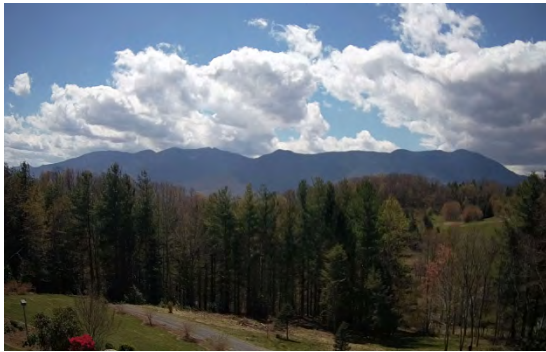
View of the Blacks from the Seven Mile Ridge webcam.

and Pensacola, https://nchighpeaks.org/weather/pensacola.php