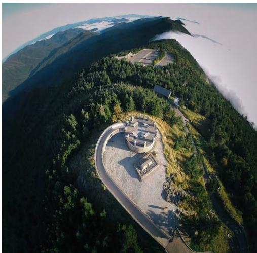
Aerial view of Mount Mitchell Summit.

In 2012 Mount Mitchell State Park asked NC High Peaks to take over management of the Park's Donation Fund. In order to perform that function we became the Friends of Mount Mitchell State Park, an official chapter of the Friends of State Parks. Over the years we have increased our support for the Park in many ways.