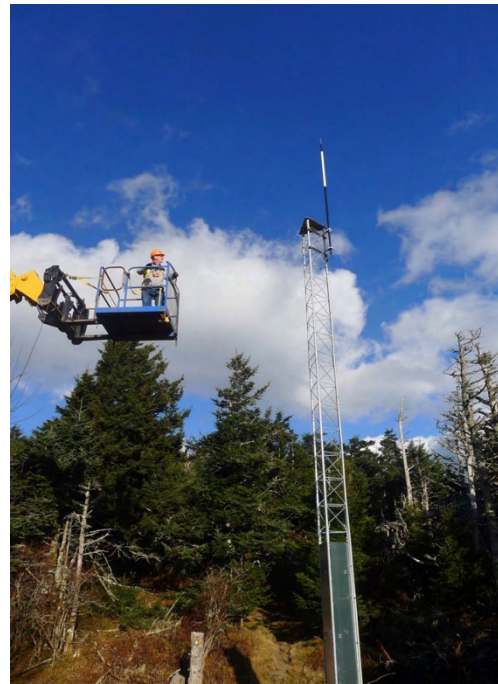
A local contractor helped to set the radio tower in place near the park office.

Some of these projects are discussed below.